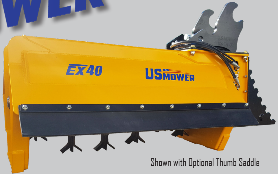
Shown with Optional Thumb Saddle