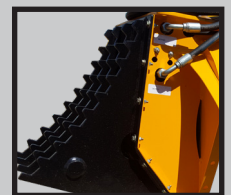
Optional thumb saddle and ground roller available.